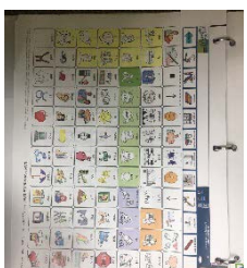
Attached to a one-page communication board.