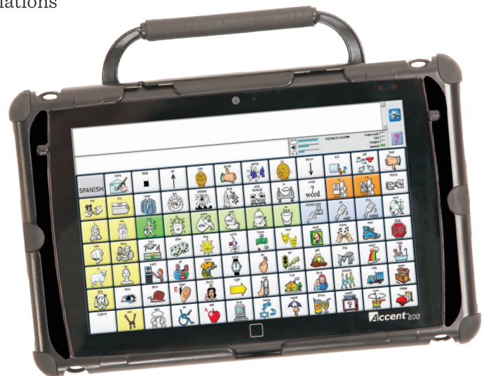
Accent® 800 with LAMP Words for Life.

UNIDAD and LAMP Words for Life - Spanish/English can be selected as the primary configuration for your device. Or, they may be added as an additional language system for $395.