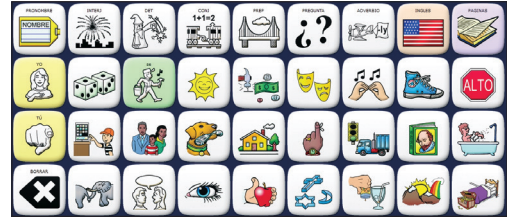
UNIDAD Spanish above and English below.