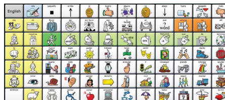
LAMP Words for Life Spanish