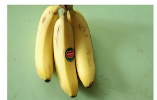
Finding the bananas.

3. Print off the story from Tar Heel Reader in PowerPoint. Circle the words with -ing as you talk about them.