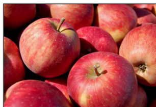
Smelling the apples.

2. Teach and model words with -ing endings as you read.