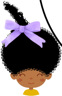
Molly Lou Melon