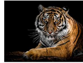
Tigers are Big Cats